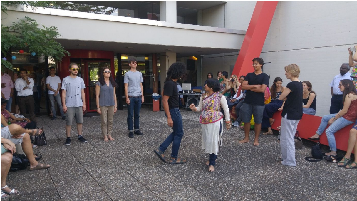
Bengali Theater at the summer fest 2017