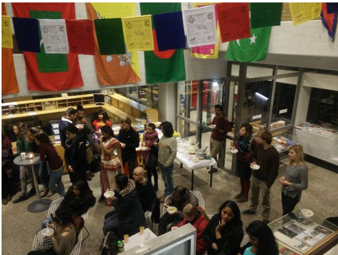
The Sri Lanka Working Group consists of students and lecturers of the SAI and is committed to the academic exchange of various faculties on the diverse subject area of Sri Lanka.