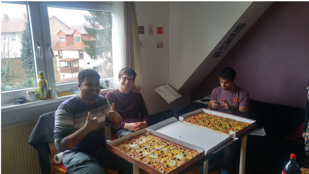
Sometimes we get food. ;-)

Every week the Fachschaftsrat heads the Fachschaftsvollversammlung (FSVV) , student general assembly). All members of the Studienfachschaft can take part and are cordially invited. Unscheduled assemblies are also convened regularly to give everyone the opportunity to express their opinion.