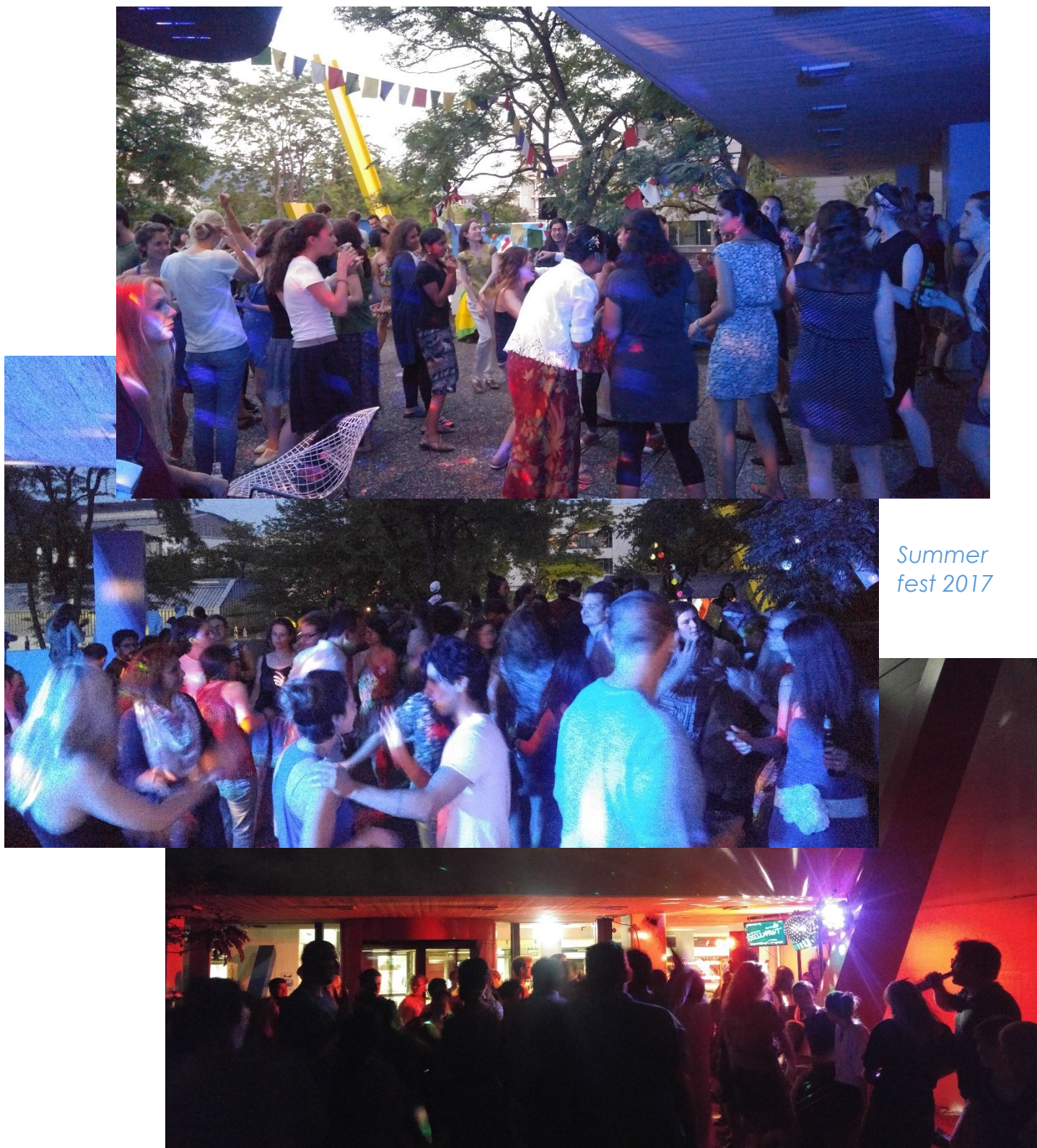
Summer fest 2017

At the end of the year, we also publish a calendar for the institute with pictures taken by students.