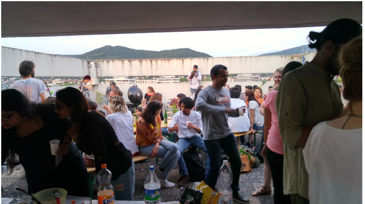
Winter fest 2017