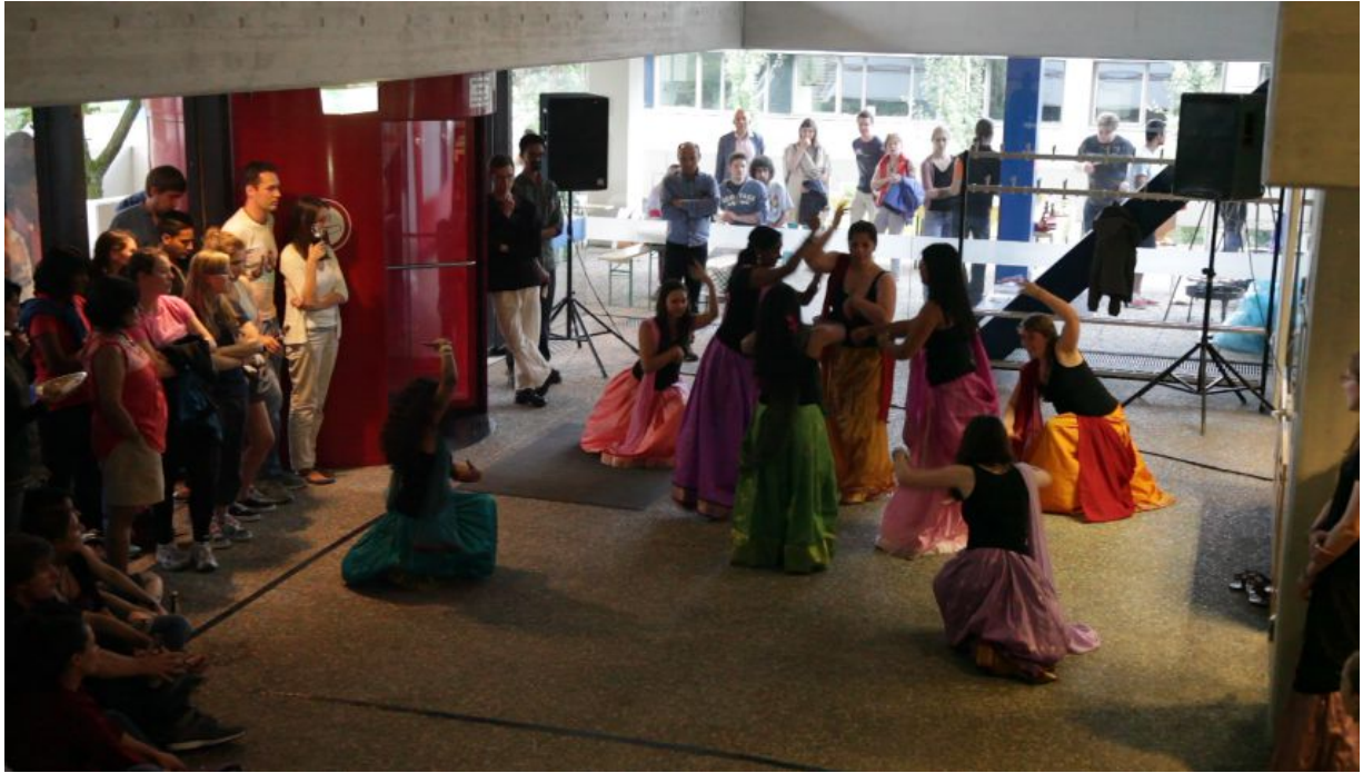
Some students practiced weekly choreographies for the summer fest to contribute a program point.